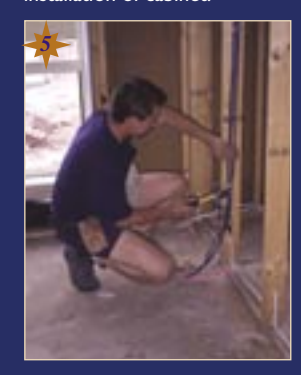
First fixing to StarServe points.