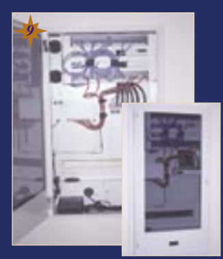
Second fixing to StarServe cabinet complete.