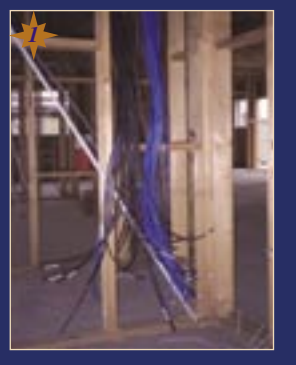
Layout of cabling completed and running back to StarServe hub in preparation for installation of cabinet.