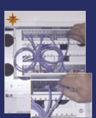
Patching in the phone and data