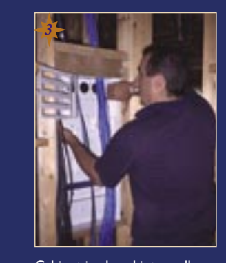
Cabinet is placed into wall ready to be screwed into its fixed position.