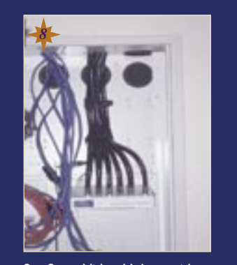
StarServe Video Hub provides whole-house distribution for Antenna and CATV signals at up to 8 television locations.